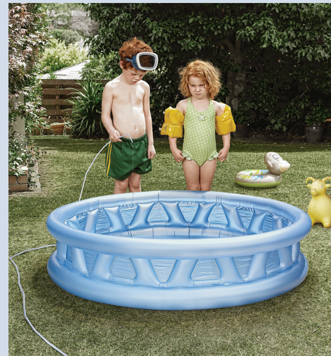
Vector: 75.4% AECT owned and making sure Aucklanders don't get the short straw on broadband.

Since Vector is majority owned by the AECT, for the benefit of Aucklanders like you, it's only fair you know a little more about what it does. Since it was established, Vector has gone from strength to strength, investing in infrastructure businesses from electricity metering to wind farms. The most exciting development though has been its fibre optic network. Over the last few years Vector has laid high speed fibre through much of the Auckland and Wellington CBDs, making it one of New Zealand's most experienced fibre optic network operators. This year they're bidding to use that experience to help deliver on the government's promise to provide ultra fast broadband to New Zealanders. You may have seen Vector's "short straw" advertising campaign. If you want to know more about this exciting opportunity for Vector – and its majority owners the AECT – take a look at fibretothedoor.co.nz .